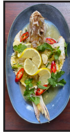
NEW! Whole fish, chilli & lime