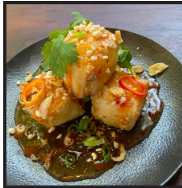
NEW! Gabbie tofu

Takeaway container 50 cents. +$1 coconut rice